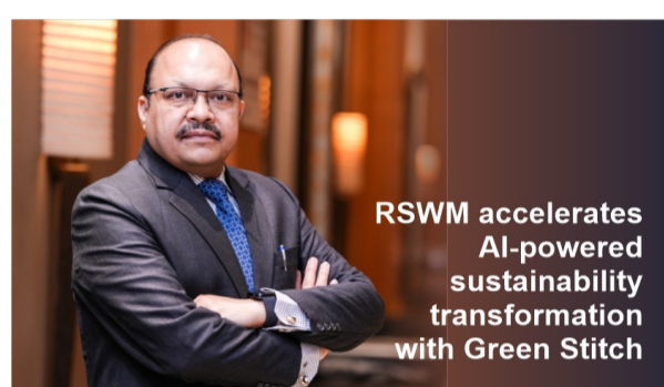
RSWM accelerates AI-powered sustainability transformation with Green Stitch