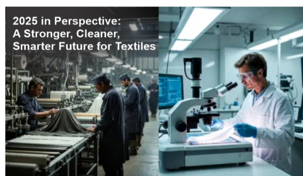
2025 in Perspective: A Stronger, Cleaner, Smarter Future for Textiles